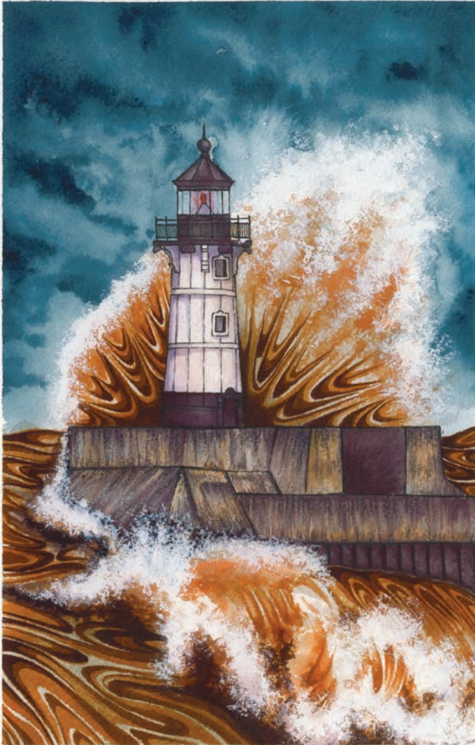
NORTH PIER LIGHTHOUSE DULUTH, MN