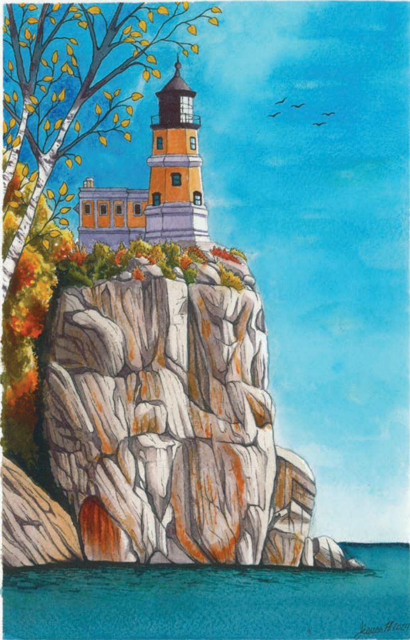
SPLIT ROCK LIGHTHOUSE TWO HARBORS, MN