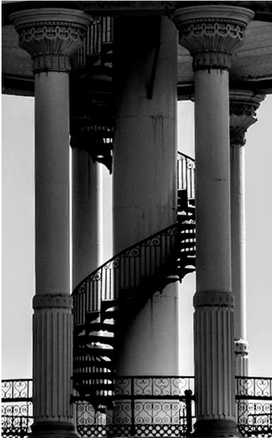
EYE BY CLAUDIA IONESCU-ROBERTSON