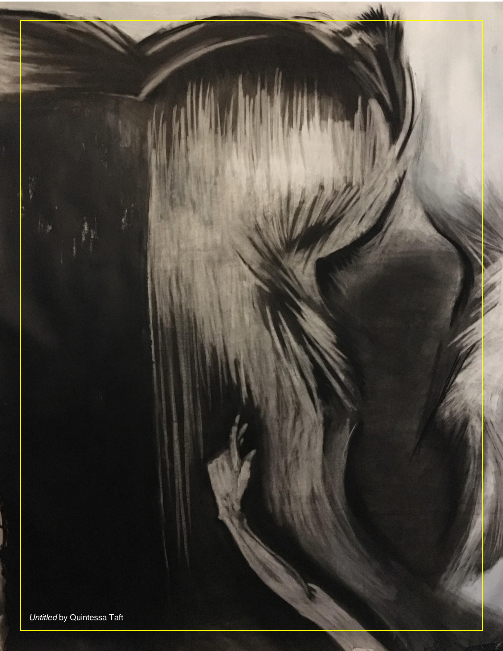
Untitled by Quintessa Taft