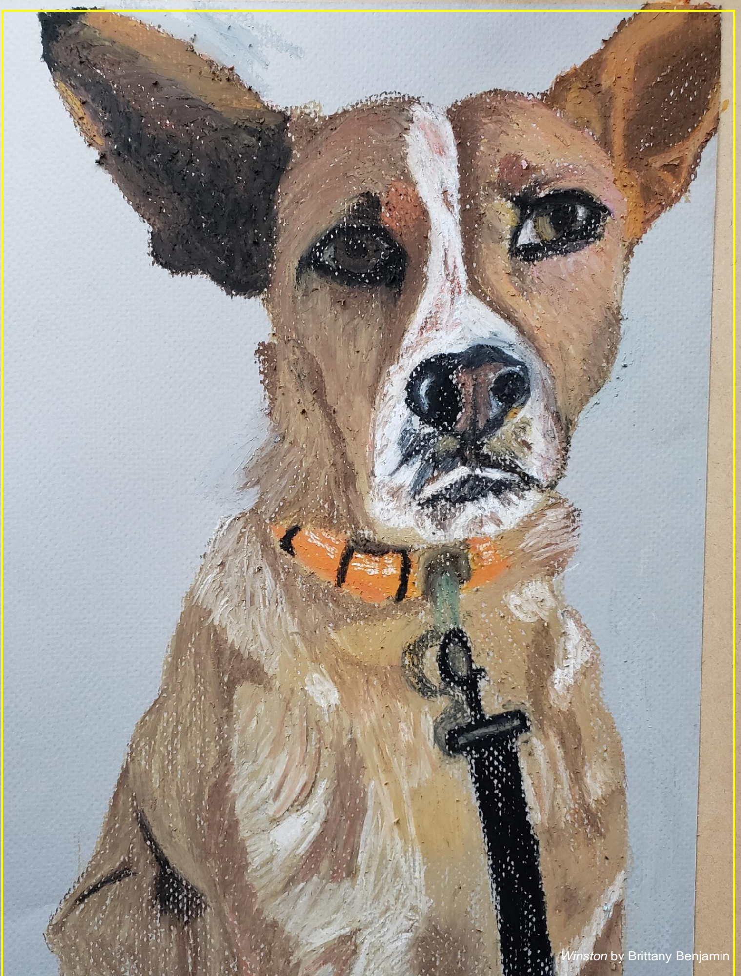
Winston by Brittany Benjamin